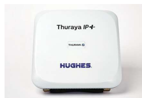
Mobile Terminals for portable communications