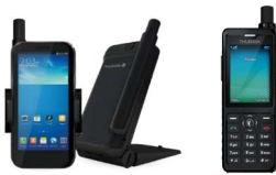
Satellite Phones for personal communications