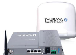
Maritime Terminals for offshore communications