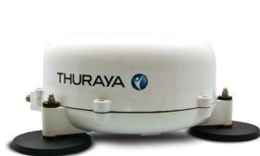
Vehicular Terminals for on-the-move communications